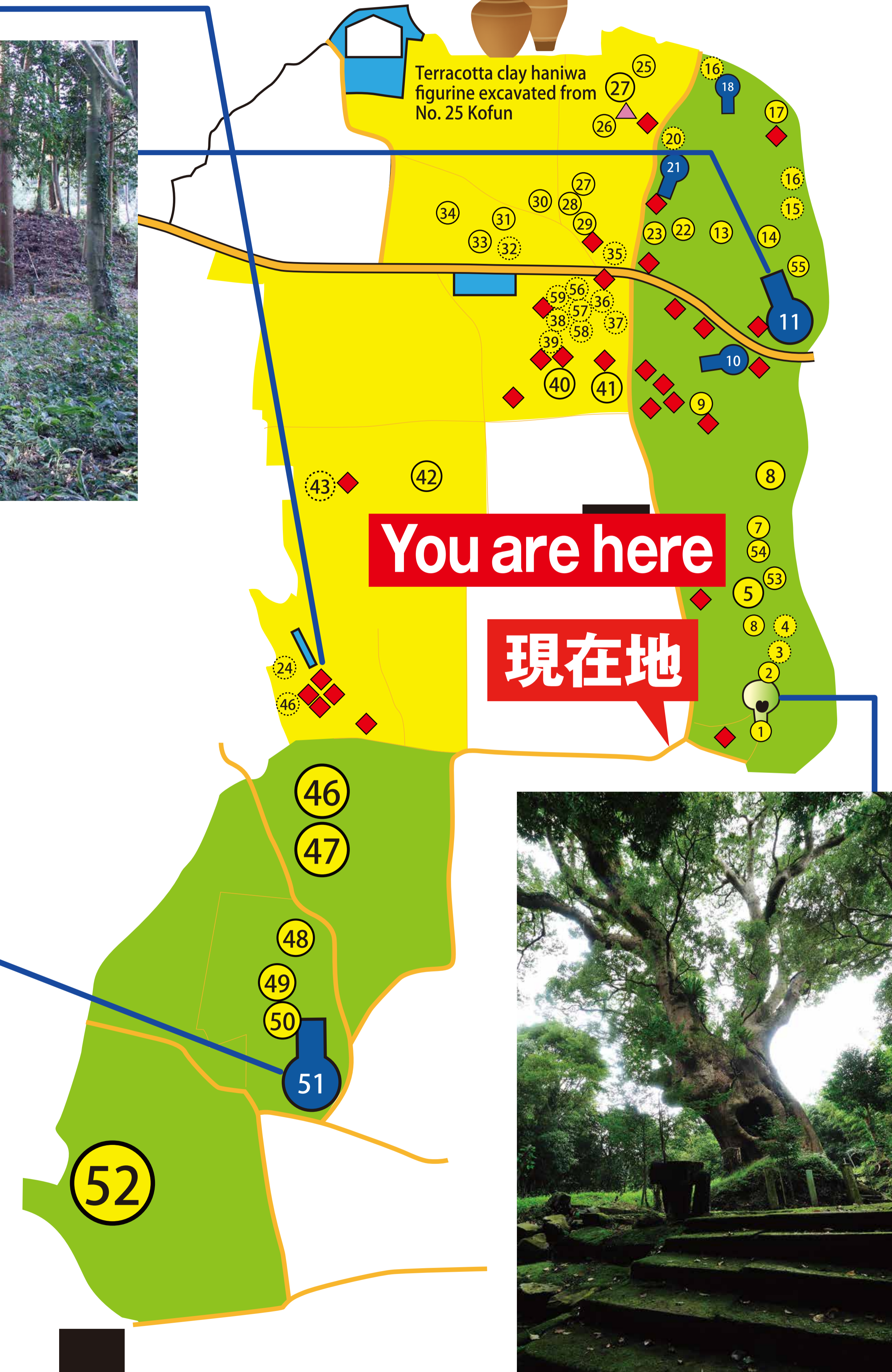
A camphor tree in Tsukazaki (designated as National Natural Monument) Tsukazaki No. 1 Kofun is located at the root of this 25-meter high tree with the trunk circumference of 14 meters. A mystic atmosphere prevails here.