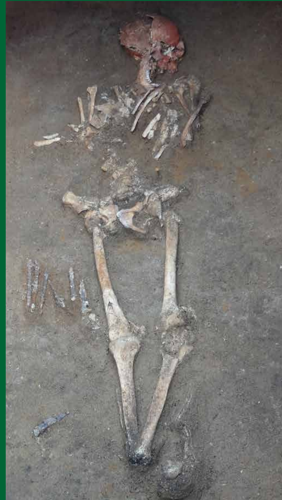
Human bones excavated from an underground horizontal cave tomb (Underground horizontal cave tomb, No. 29)