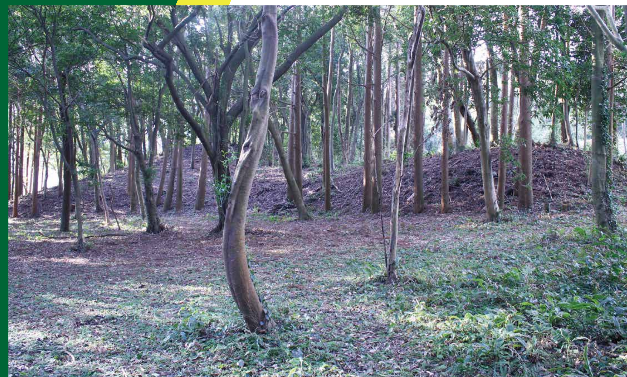
The first key-hole shaped Kofun constructed in the Osumi region (No. 11 Kofun)